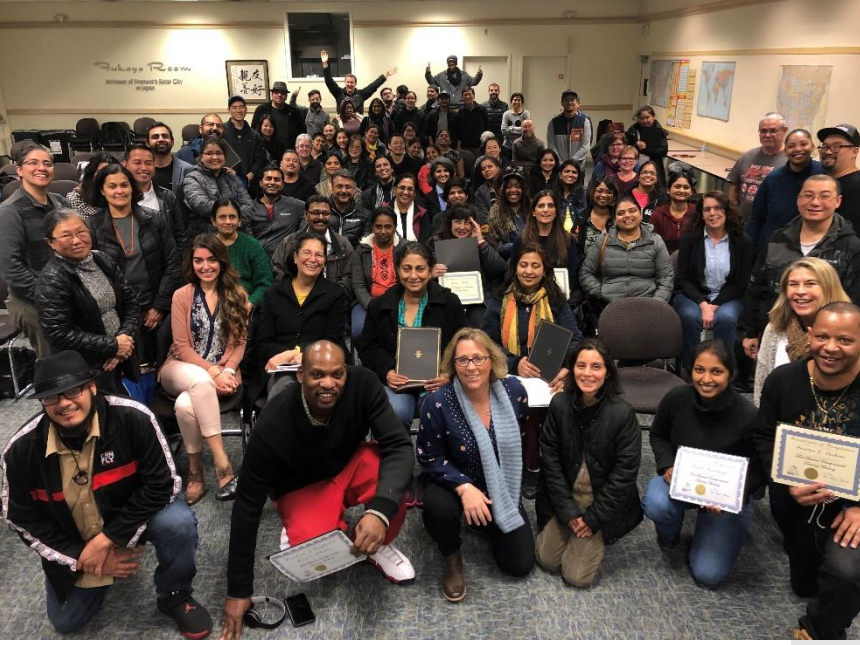
Fremont 2019 Grads, 73 Participants!

Sign Up → <a href="http://www.acsbdc.org/">http://www.acsbdc.org/</a>