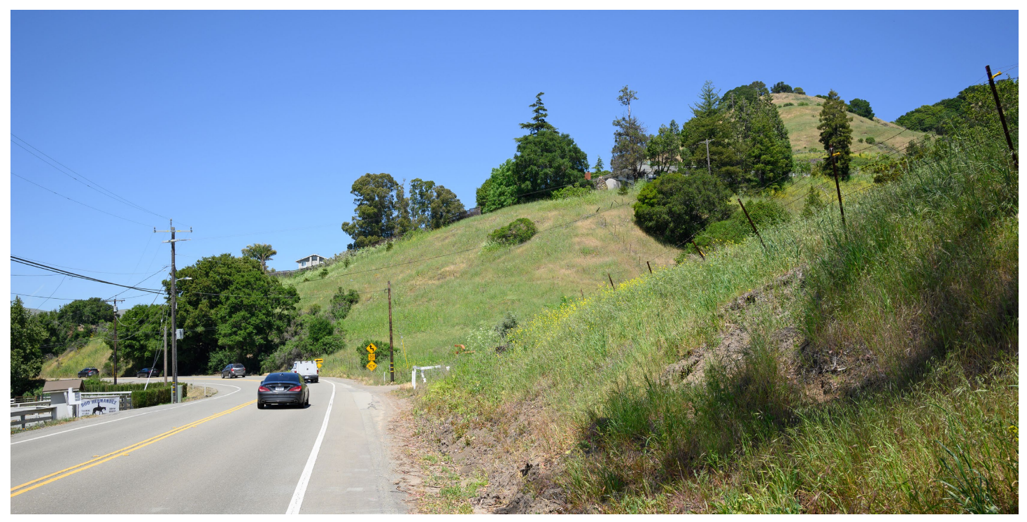
1) Existing View from Crow Canyon Road looking northeast (wide-angle)