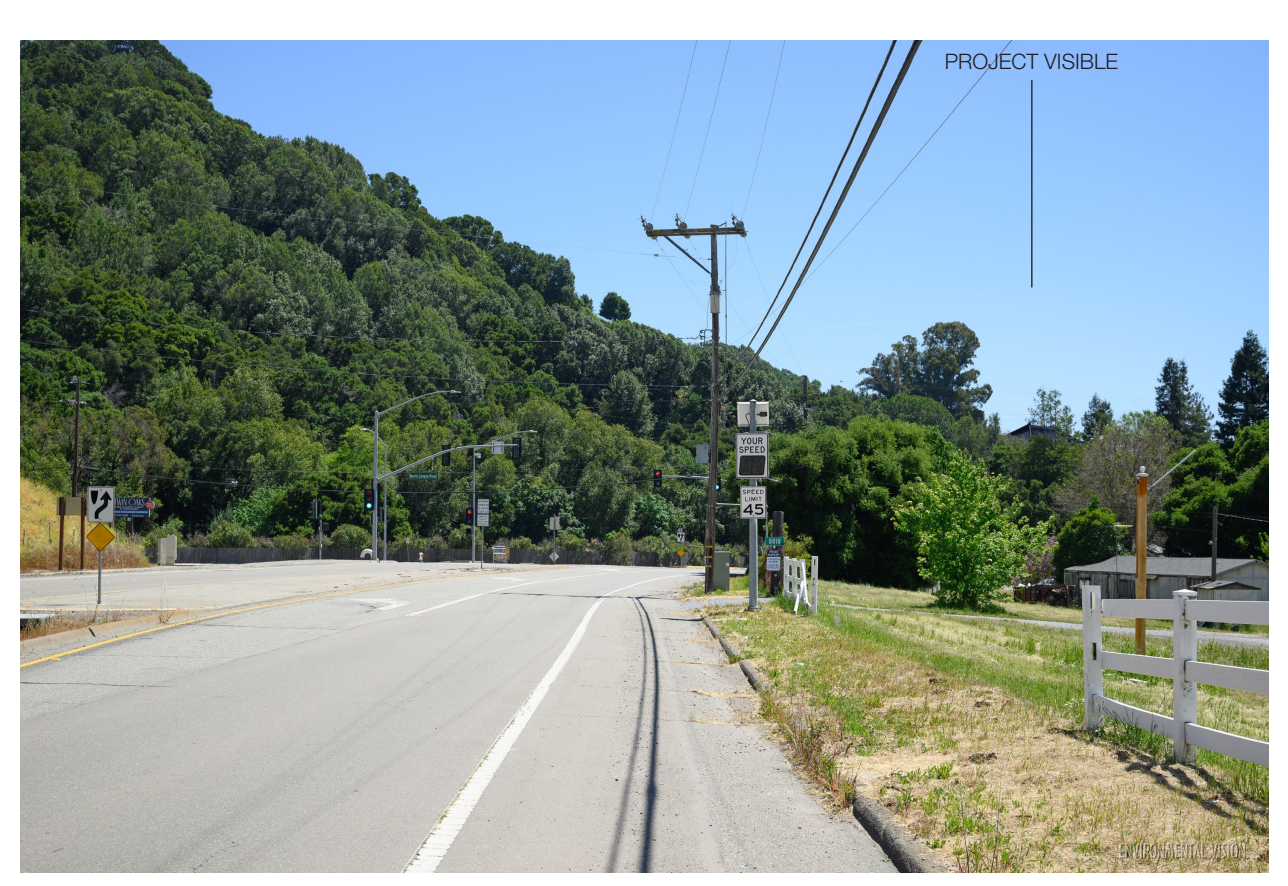
Visual Simulation of Proposed Project