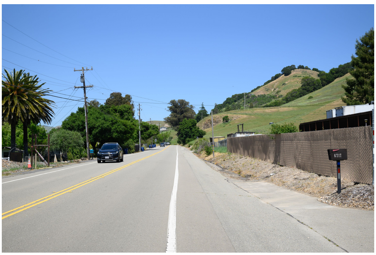
2) Existing View from Crow Canyon Road looking northeast