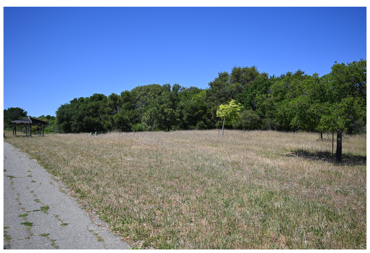
5) Greenridge Park looking northeast - project not visible