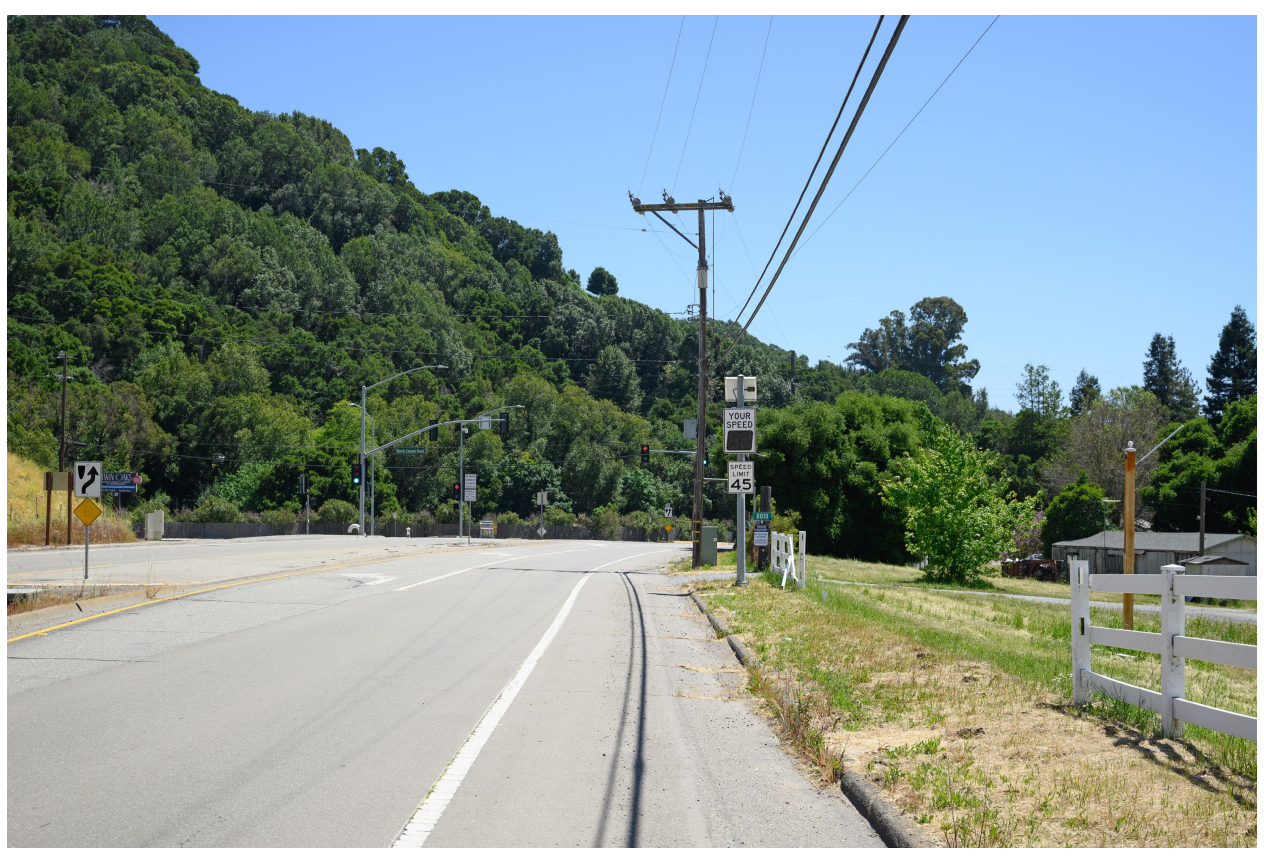
3) Existing View from Crow Canyon Road near Norris Canyon Road looking south