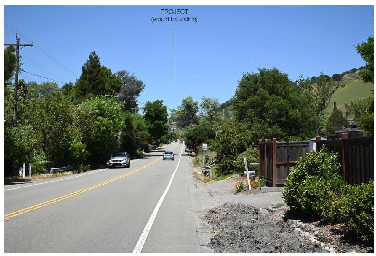
4) Crow Canyon Road looking northeast