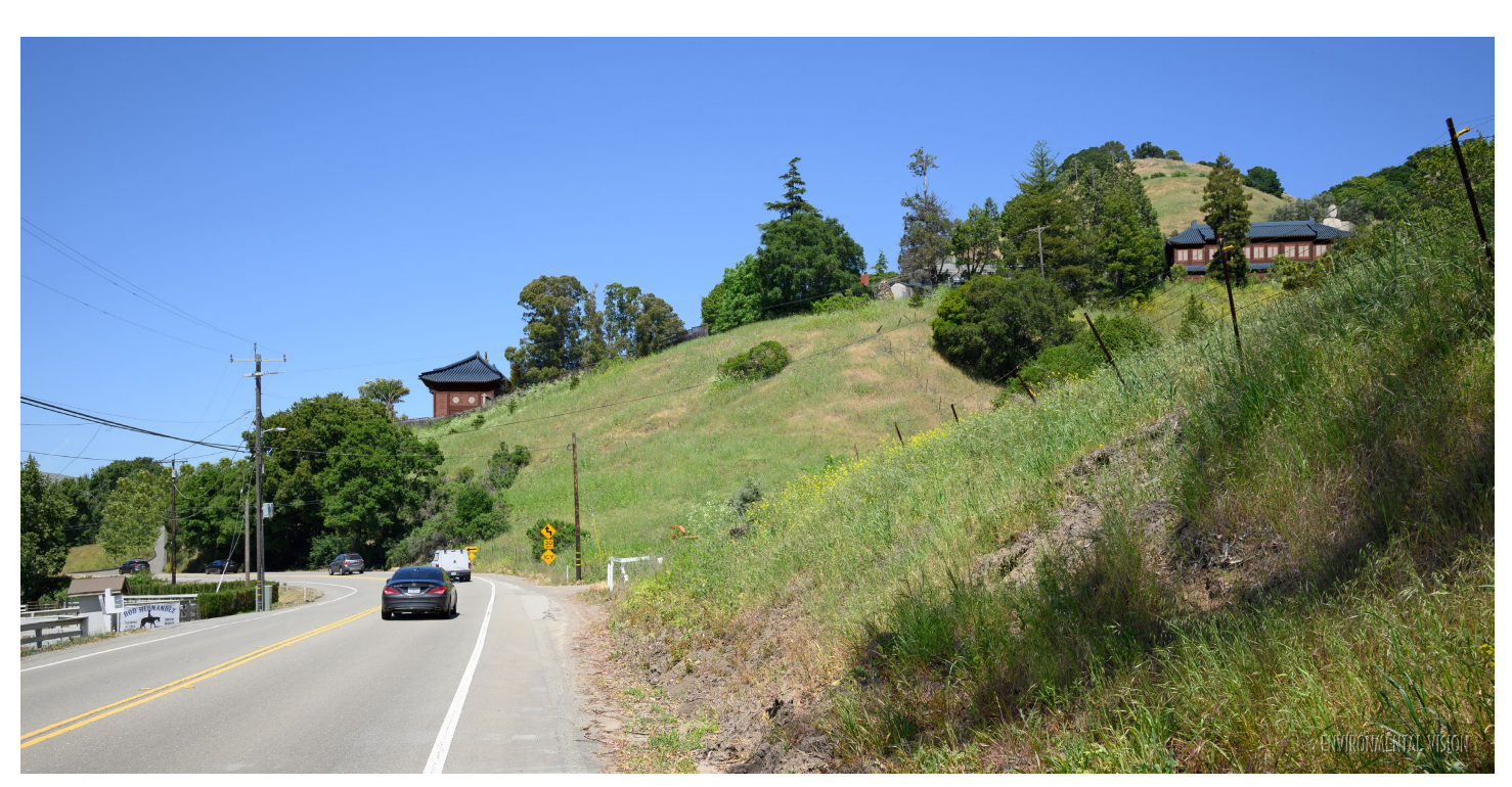
Visual Simulation of Proposed Project