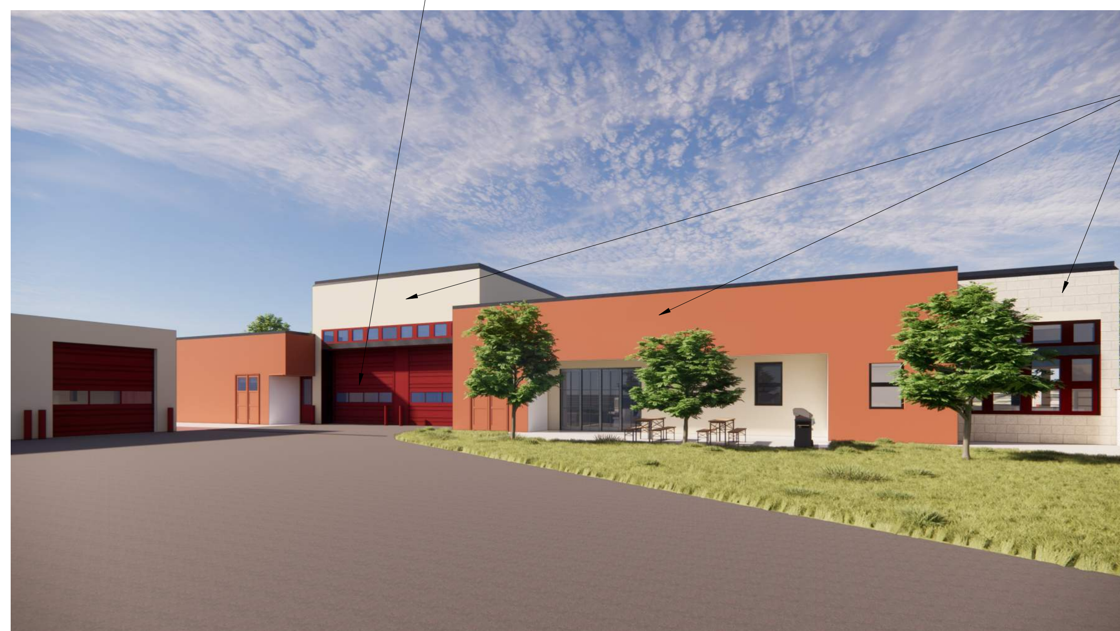
PERSPECTIVE FROM SOUTH EAST TO REAR ENTRY

Recessed RED opening to mimic the fire station front entry opening.