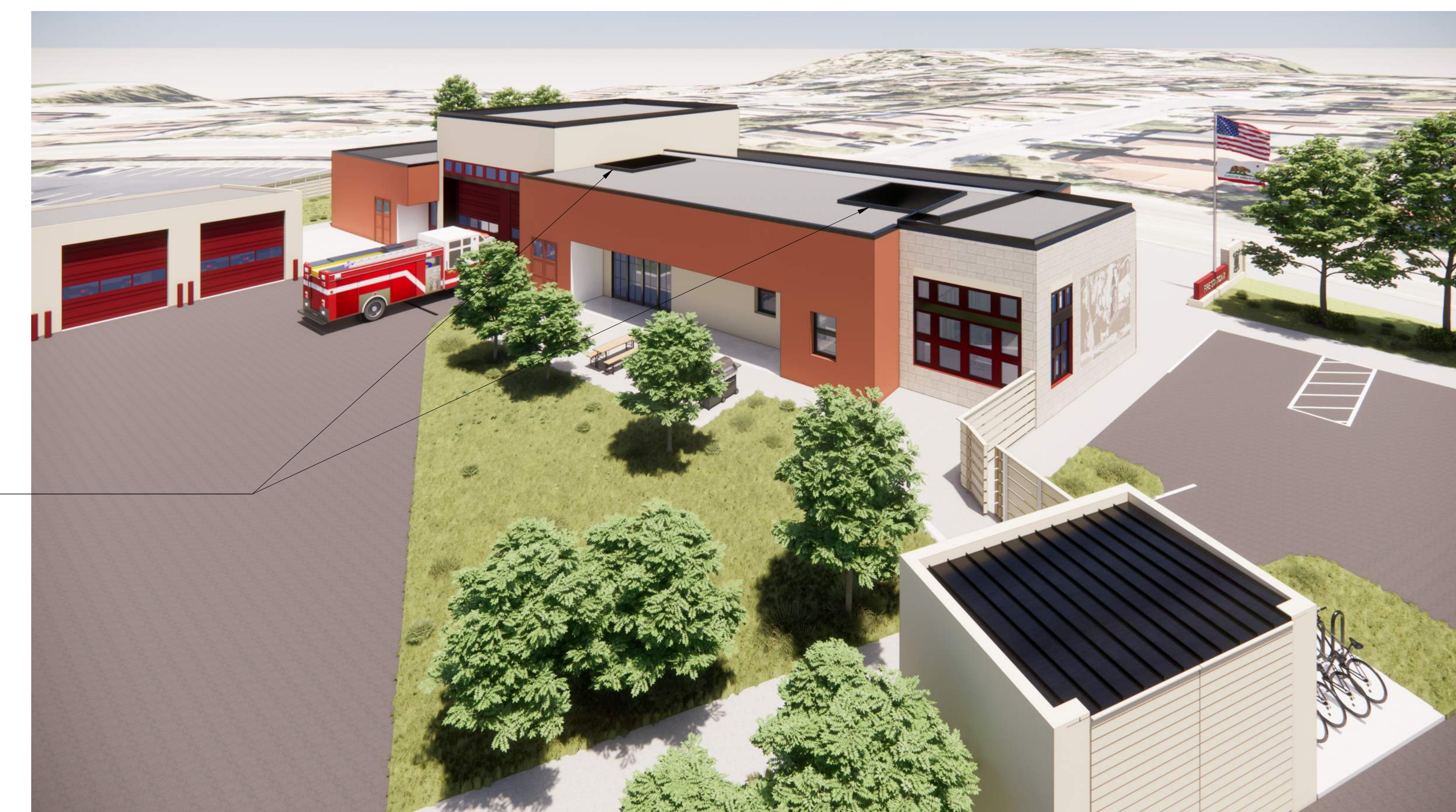
AERIAL VIEW FROM SOUTH EAST

Rooftop equipment to be located strategically in roof wells with drains to not interfere with sightlines.