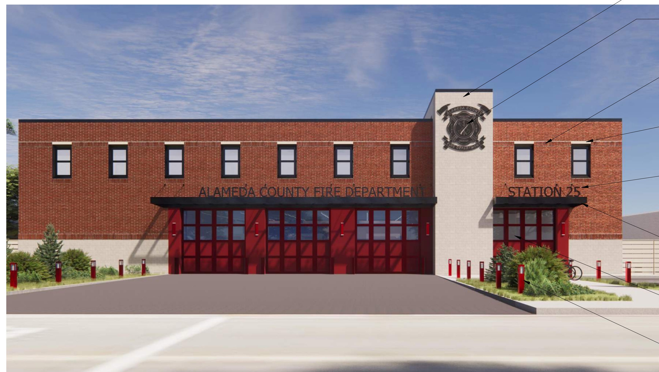
PERSPECTIVE FROM NORTH WEST TO FRONT ENTRY