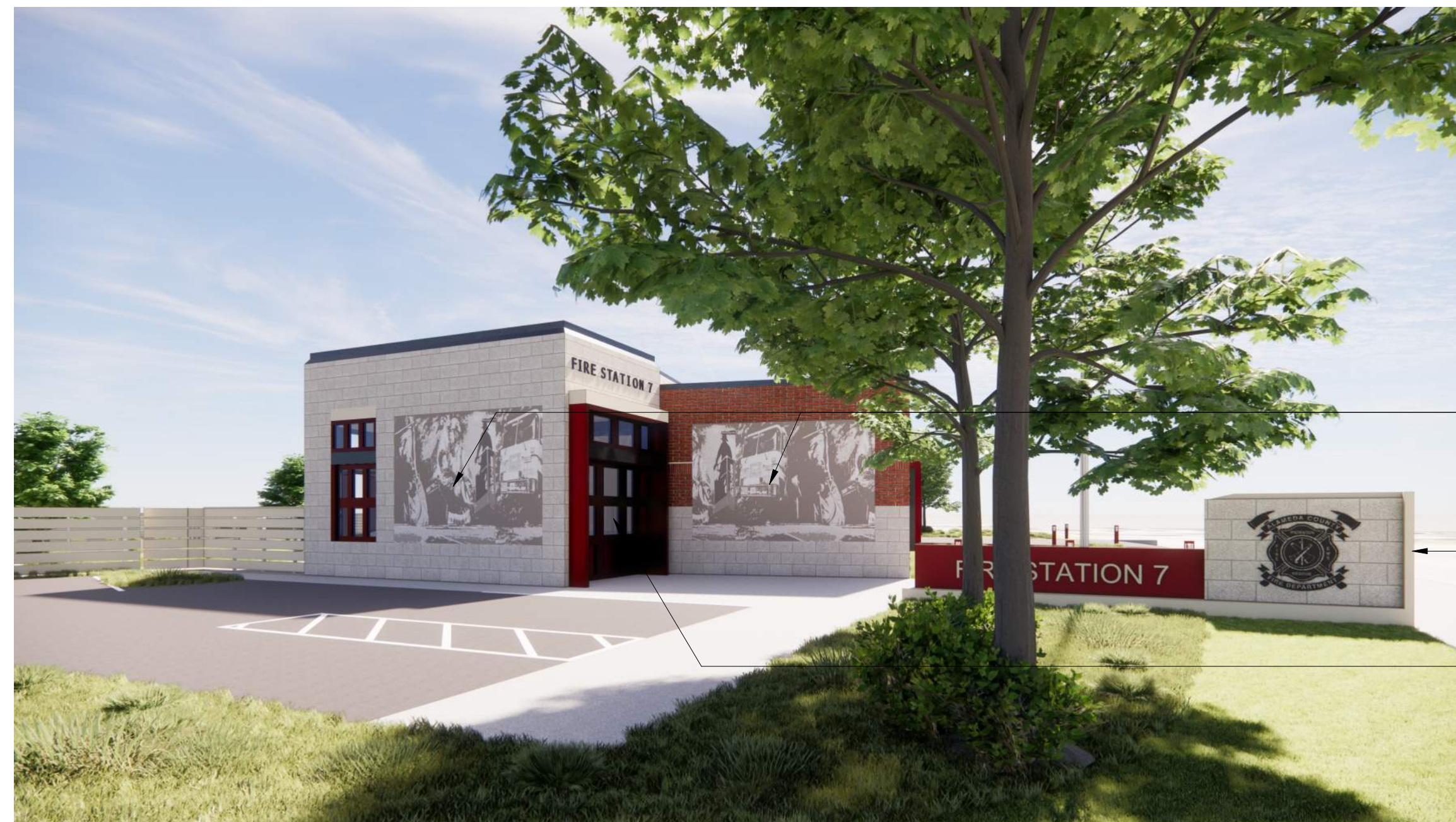
PERSPECTIVE FROM EAST TO MAIN ENTRY

Public art wall in the form of porcelain enamel on steel panelized cladding to be inset into wall, face of artwork flush with wall finish. The design intent is to align with the head and sill of the windows and for the wall art to act as "visual picture windows."