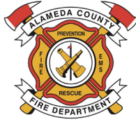
EXHIBIT A PROPOSAL RESPONSE PACKET