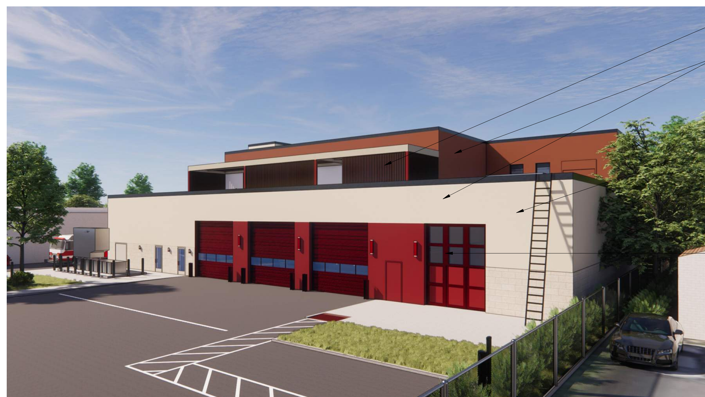
PERSPECTIVE FROM NORTH EAST TO REAR ENTRY