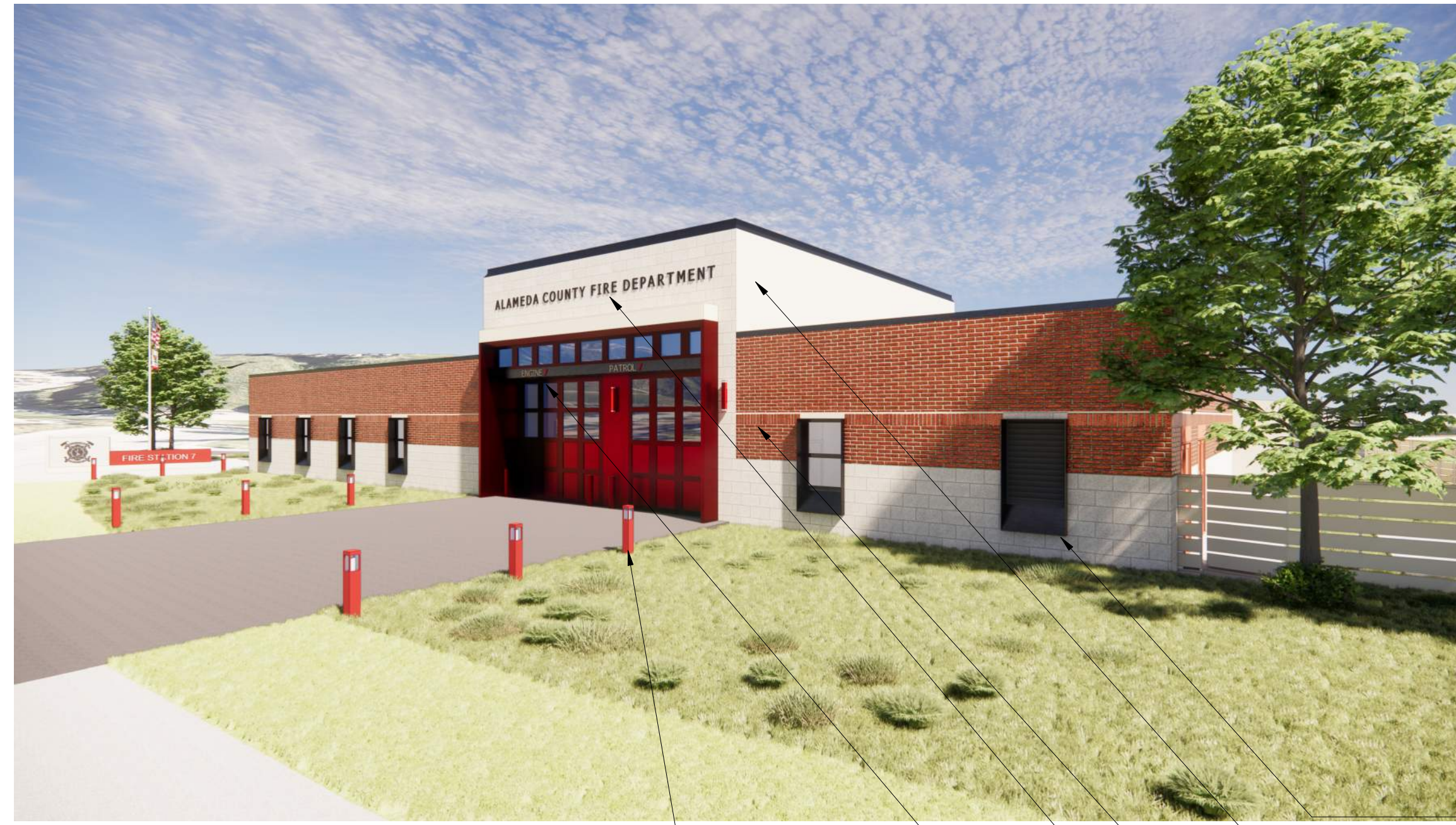
STREET VIEW FROM NORTH WEST TO APP BAY ENTRY

Pedestrian bollard lights to be factory finished in red color to match the apparatus bay doors.