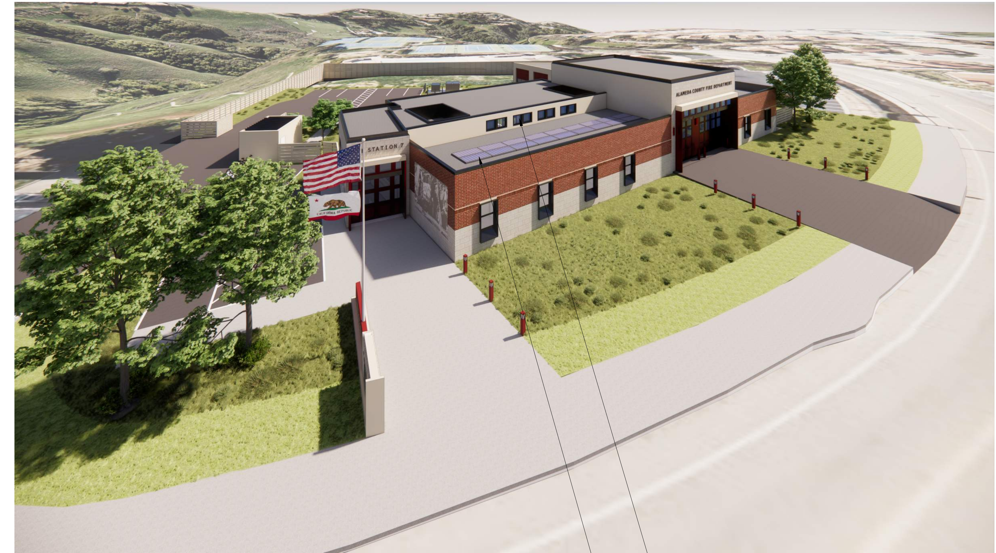
AERIAL VIEW FROM NORTH WEST

Recessed apparatus bay doors with insulated metal panel portal frames at entries act as "porches" to announce arrival; so the entry area is not in deep shade. The recessed entry provide weather protection for the apparatus bay doors and building entry.