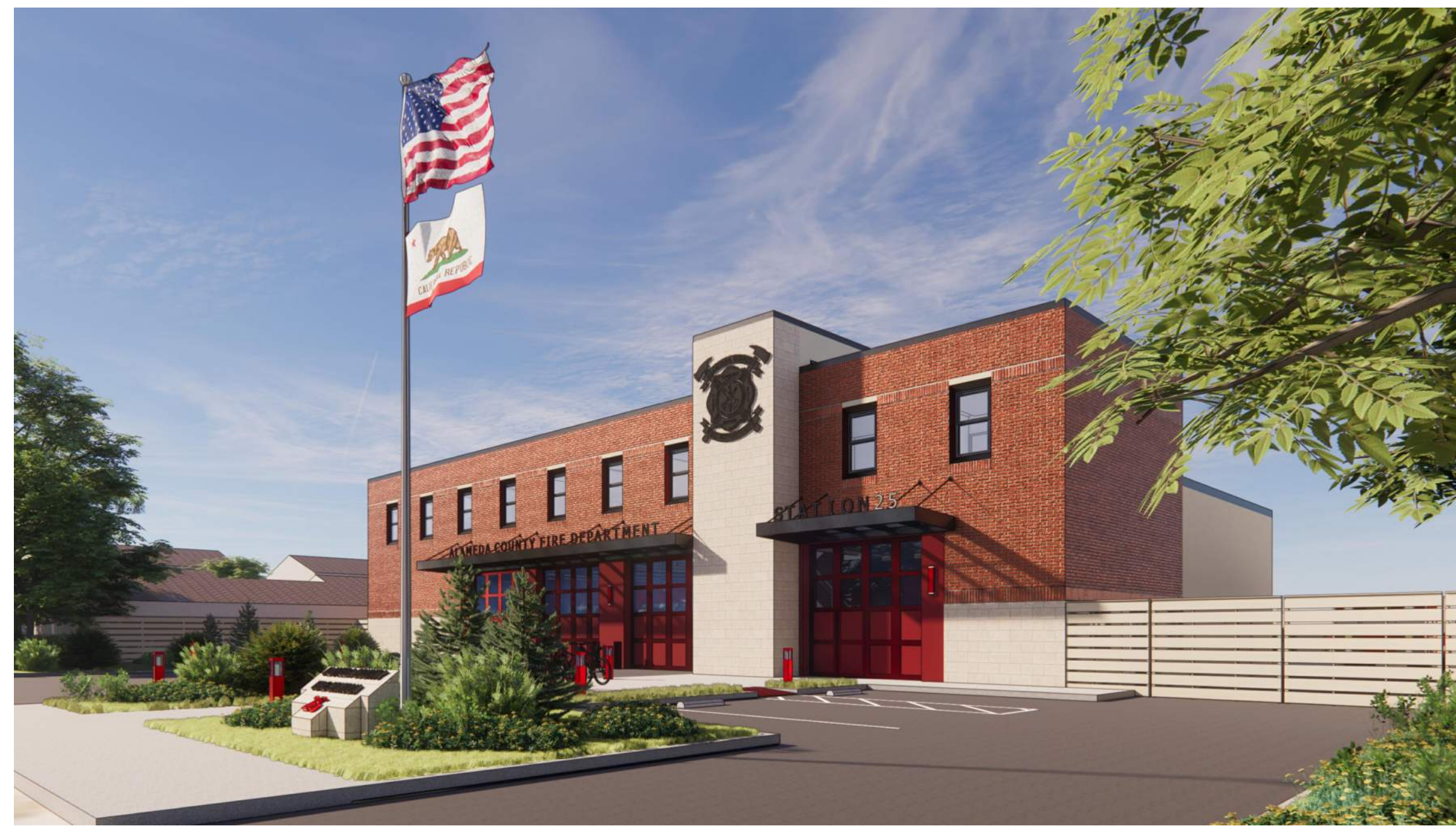
STREET VIEW FROM SOUTH WEST TO FRONT ENTRY