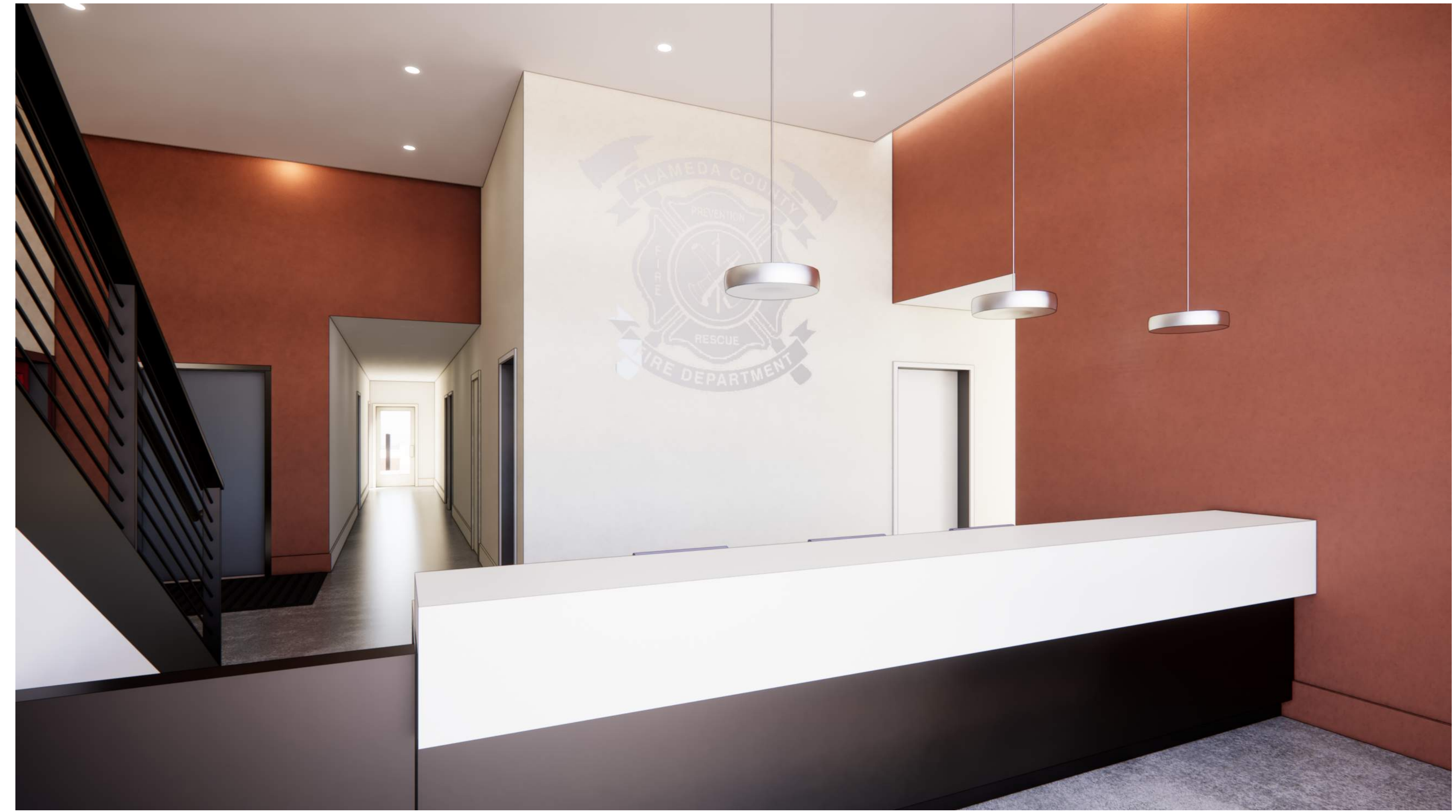
LOBBY INTERIOR VIEW