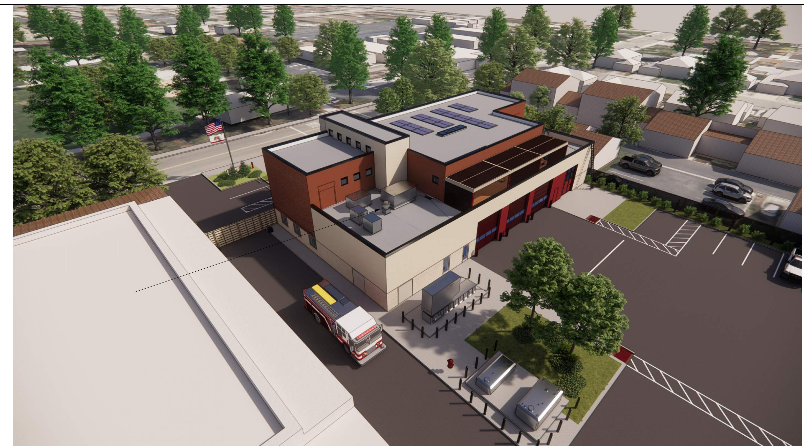
AERIAL VIEW FROM SOUTH EAST

PICTORIAL RENDERINGS ARE FOR GRAPHIC REFERENCE ONLY For project scope and configuration, see measured drawings.