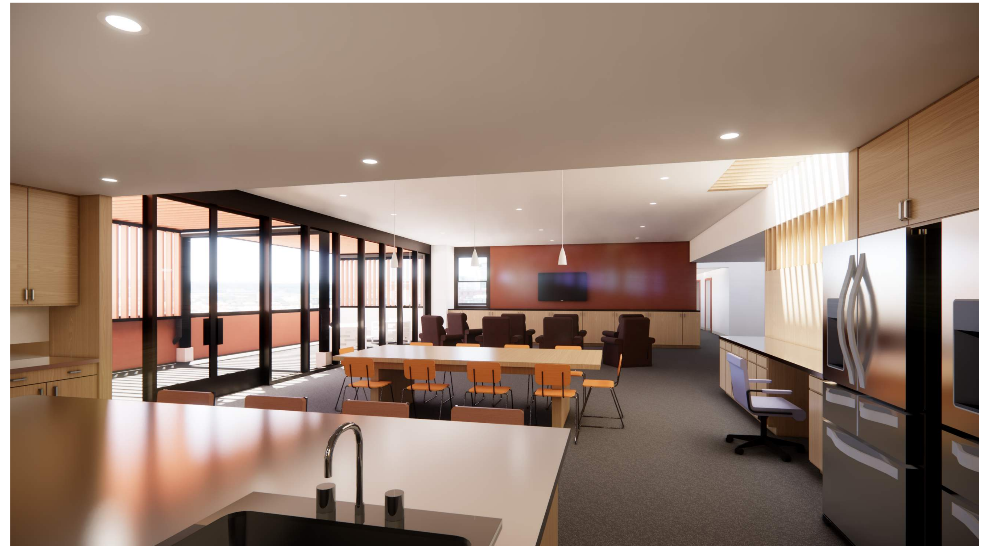
DAY-ROOM INTERIOR VIEW