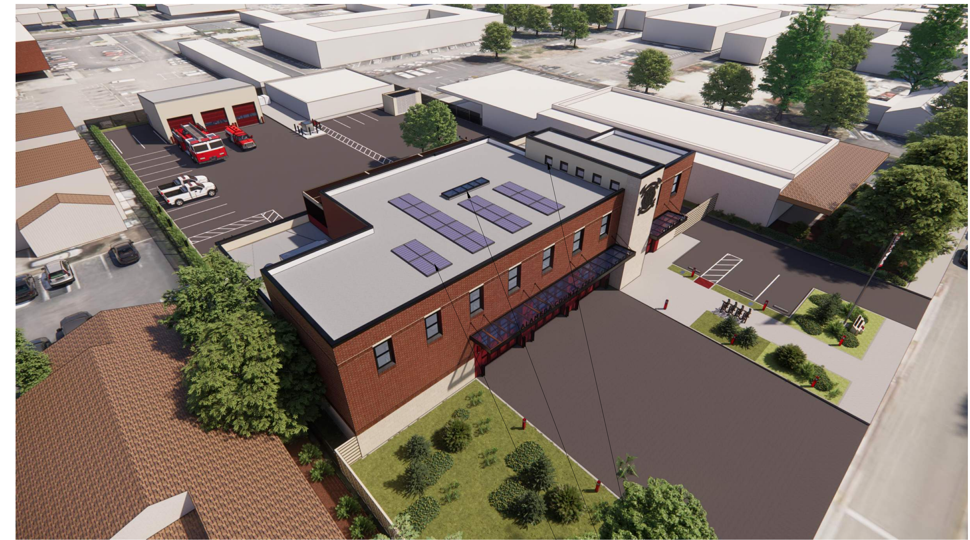
AERIAL VIEW FROM NORTH WEST

These two materials are complemented with two additional materials: fire-engine red metal at the apparatus and building entries, and a dark-charcoal steel and glass canopy and window detailing. These elements all constitute the “kit-of-parts” referenced above.