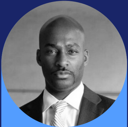
The Public Defender