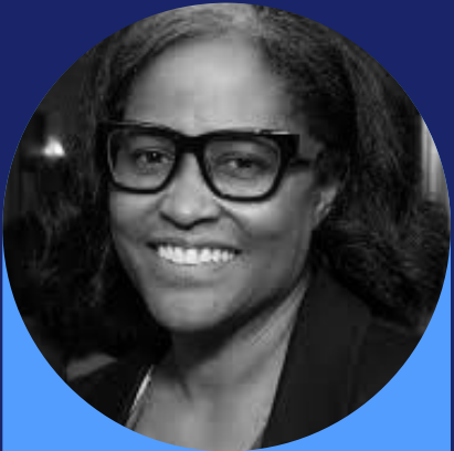
The District Attorney