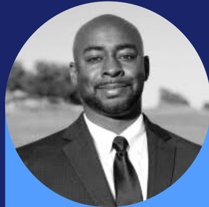
The Chief Probation Officer