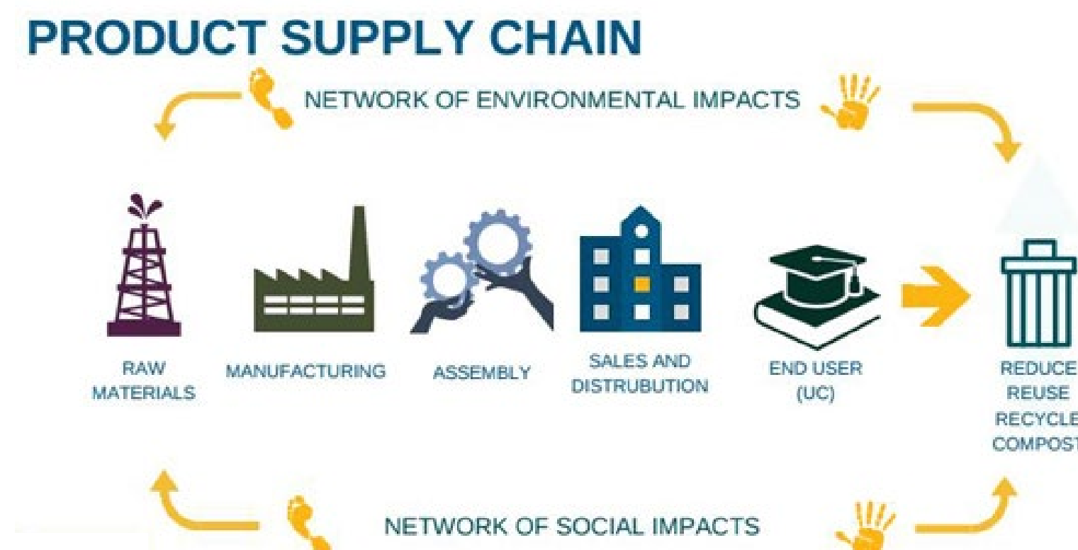
Fig.1: Product Supply Chain Cycle & Impacts

Governments, collectively, spend about $1.6 trillion a year in expenses. That amount of money holds great power and a large opportunity to make an impact. With Alameda County employing close to 10,000 staff, it is important that clear & concise information is available for training purposes. The Office of Sustainability found that one aspect of staff training that could be improved was education on green purchasing and its role on staff's everyday work routine.